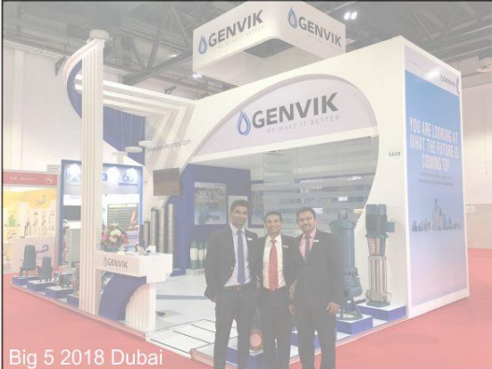
Big 5 2018 Dubai