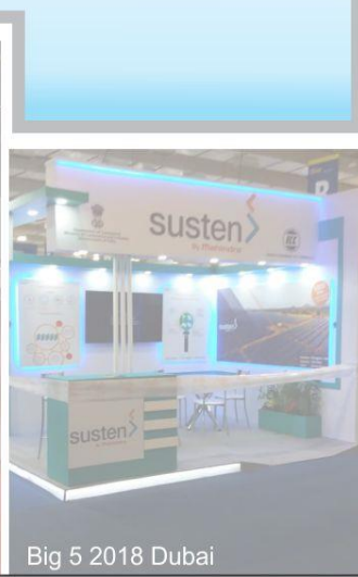
Big 5 2018 Dubai