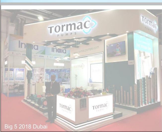
Big 5 2018 Dubai