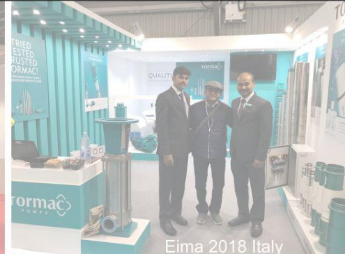
Eima 2018 Italy