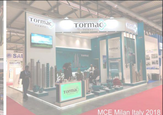
MCE Milan Italy 2018