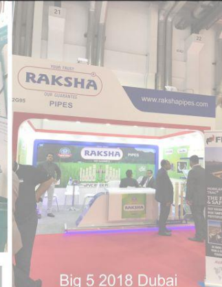
Big 5 2018 Dubai