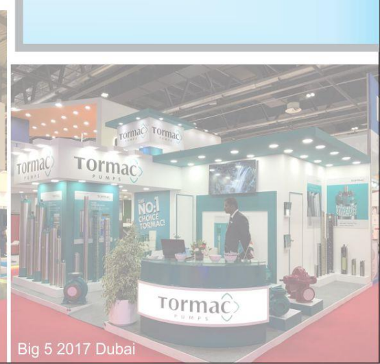
Big 5 2017 Dubai