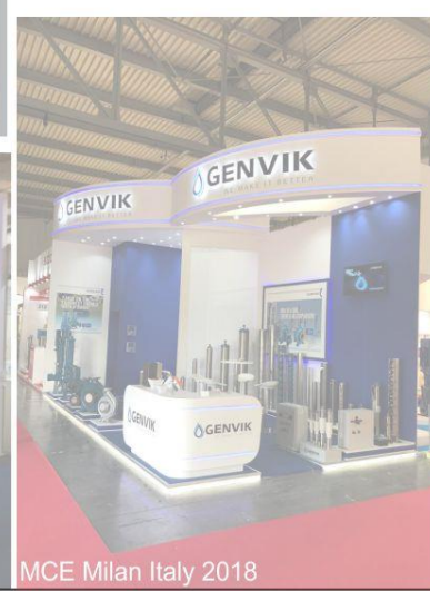
MCE Milan Italy 2018